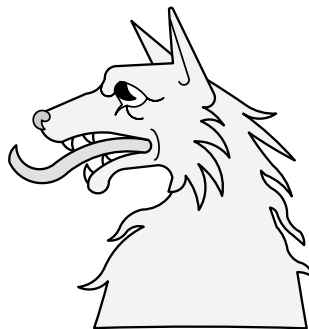
Wolf's Head Couped (3)