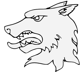
Wolf's Head Erased (1)