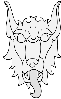
Wolf's Head Cabossed (3)