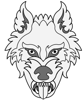
Wolf's Head Cabossed (1)