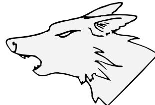
Wolf's Head Couped (4)