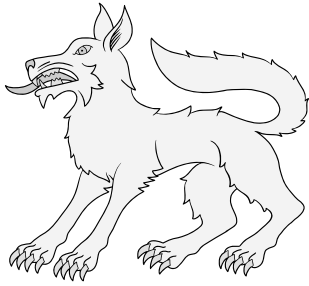
Wolf Statant (6)