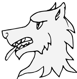
Wolf's Head Erased (2)