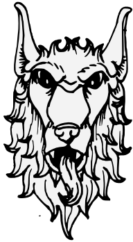
Wolf's Head Cabossed (2)