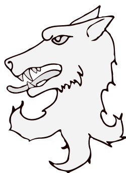
Wolf's Head Erased (3)