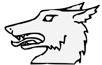
Wolf's Head Couped (1)