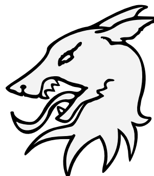
Wolf's Head Erased (4)