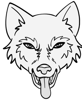
Wolf's Head Cabossed (4)